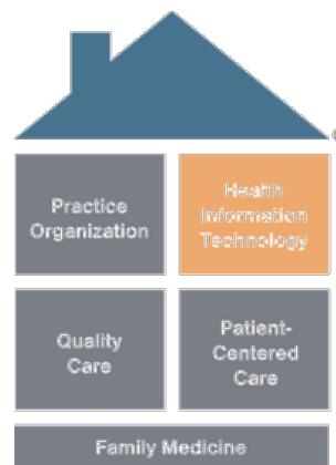
Exhibit 5: Care Coordination and Health IT 2

In order to implement these innovative approaches, practice staff must embrace change. The following key change management actions can be applied to implementing the PCMH model of care.