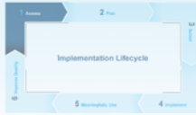
Exhibit 3: Overview of the Three Phases of Kotter’s Change Management Model and Related Actions for MU1 to MU2: