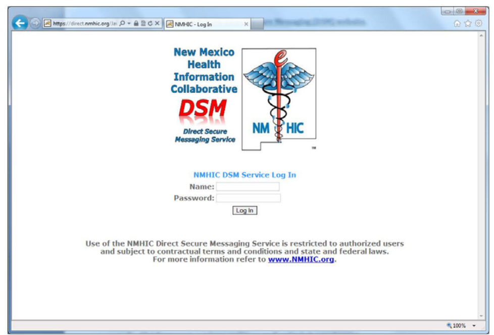
NMHIC DSM Log-in page