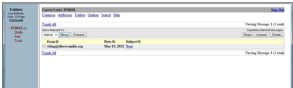
NMHIC DSM Inbox page