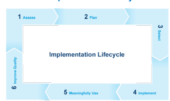
EHR Implementation Lifecycle

The following resource can be used in support of the <u>EHR Implementation Lifecycle</u>. It is recommended by "boots-on-the-ground" professionals for use by others who have made the commitment to implement or upgrade to certified EHR systems.