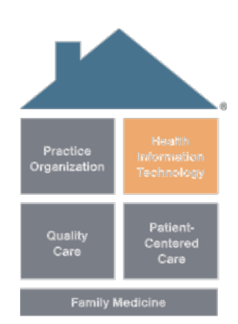
Exhibit 5: Care Coordination and Health IT<sup>2</sup>

In order to implement these innovative approaches, practice staff must embrace change. The following key change management actions can be applied to implementing the PCMH model of care.