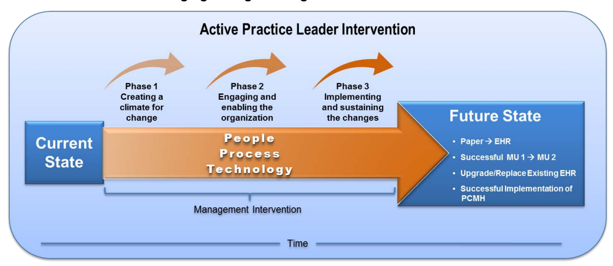
Exhibit 7: Managing Change Through Active Practice Leader Intervention

As illustrated in Exhibit 7, practice leadership must keep track of the progress of practice change initiatives and be prepared to rapidly intervene to fix problems throughout all phases of implementing any organizational change.